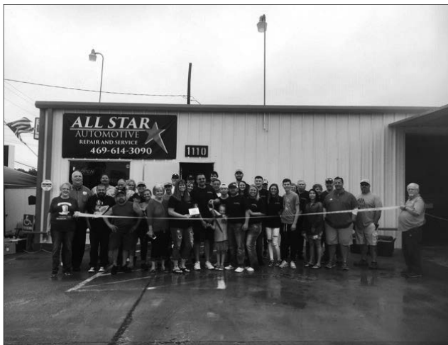
All Star Automotive Repair & Service