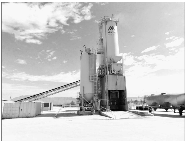
Martin Marietta Ready Mix Concrete