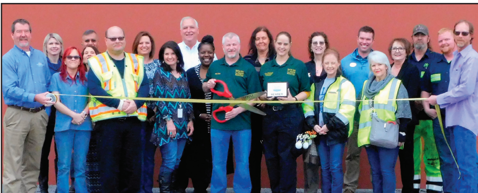
EastTex Regional CERT