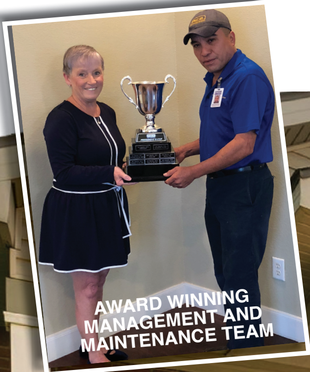
AWARD WINNING MANAGEMENT AND MAINTENANCE TEAM