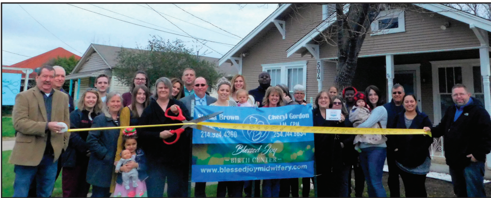
Blessed Joy Birth Center