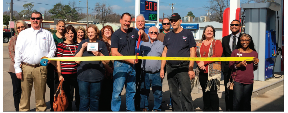
Uncle Skotty's Exxon