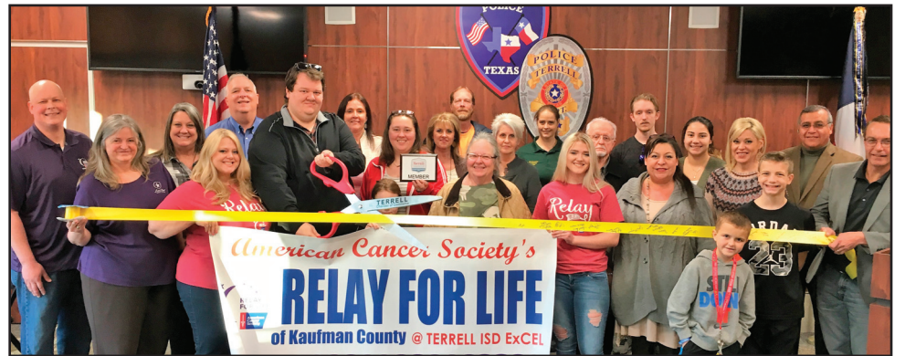
American Cancer Society